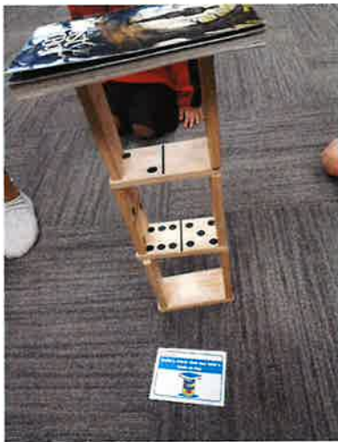
Blocks: Braxton's tower

Students in Phase 1 enjoyed learning 'hands on' this week when they completed some STEM challenges (Science, technology, engineering, maths). They had to build the tallest tower that would hold a book using blocks and design a boat that would float.