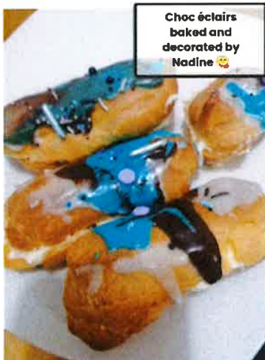
Choc éclairs baked and decorated by Nadine 🍩